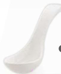
SYMPHONY SOUP SPOON RD-1041 Size : 5.7" | 14.5cm ₹ 55/- Qty.: 288