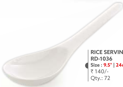
RICE SERVING SPOON RD-1036 Size : 9.5" | 24cm ₹ 140/- Qty.: 72