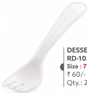
DESSERT FORK RD-1038 Size : 7" | 18cm ₹ 60/- Qty.: 216