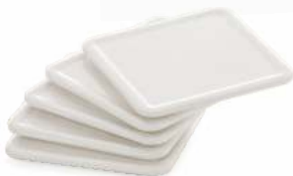
SQUARE COASTER CO-10015 Size : 3.5" | 9cm ₹ 50/- Qty.: 144