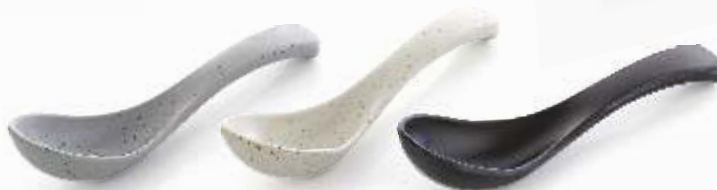
PERSIAN SOUP SPOON HD-5029 Size : 5.7" | 14.5cm ₹ 60/- Qty.: 288