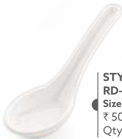
STYLO SOUP SPOON RD-1039 Size : 5" | 13cm ₹ 50/- Qty.: 288