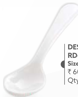
DESSERT SPOON RD-1037 Size : 7" | 18cm ₹ 60/- Qty.: 216