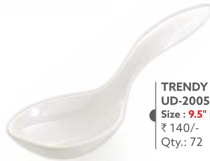
TRENDY SERVING SPOON UD-2005 Size : 9.5" | 24cm ₹ 140/- Qty.: 72