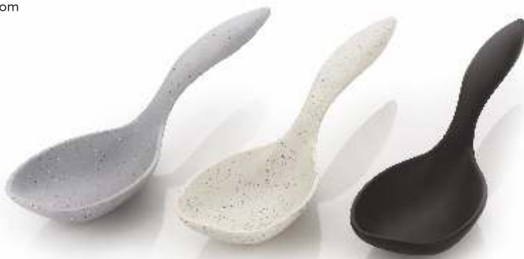
MODISH SERVING SPOON UD-2011 Size : 9.5" | 24cm ₹ 145/- Qty.: 72