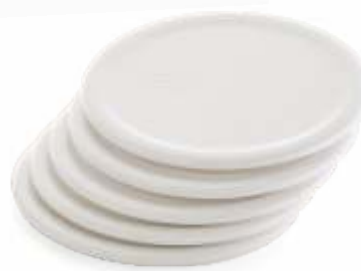
ROUND COASTER CO-10014 Size : 3.5" | 9cm ₹ 45/- Qty.: 144